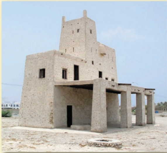
The tower from the north

The lush and fertile palm gardens of Nakheel have always been an important source of food and water. Many people lived inside these shady oasis and more came during the summertime, to escape the harsh heat and humidity. They lived in mud brick buildings and palm frond huts ("Areesh"), but rarely in stone houses, which were only built by local Sheikh families.