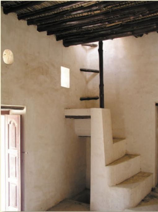
Access to the roof from the majlis