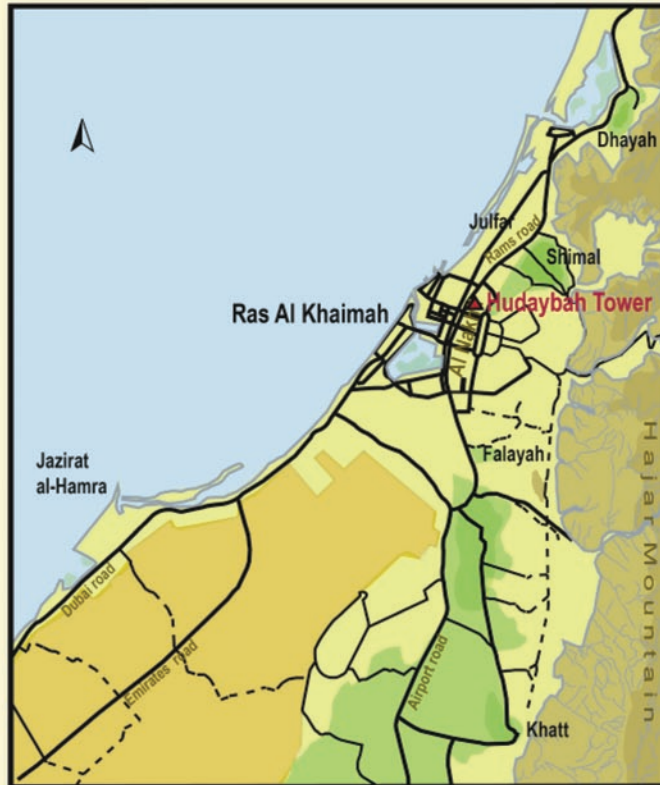
Location of Hodaybah Tower