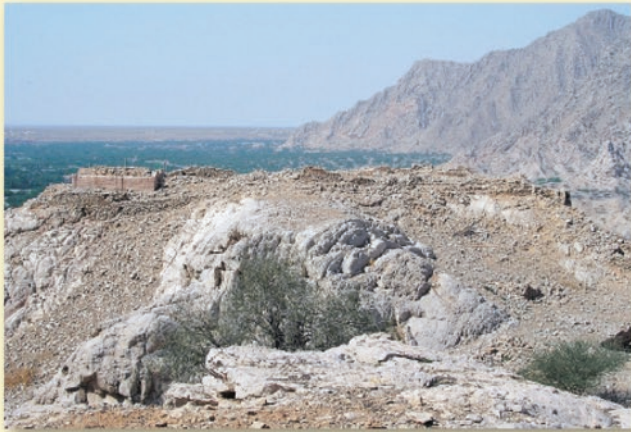
The palace area seen from the south

This medieval palace is situated on a ridge above the village of Shimal.