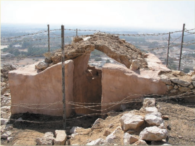
The roofed cistern