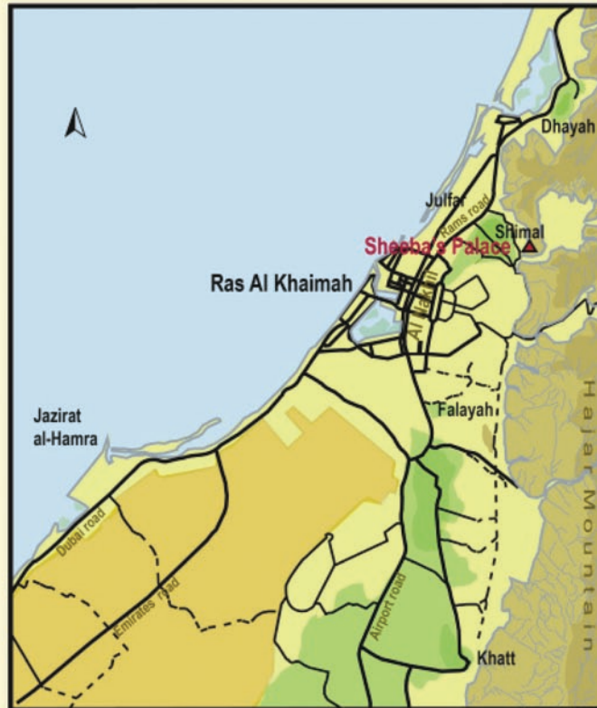
Location of the Queen of Sheeba's Palace