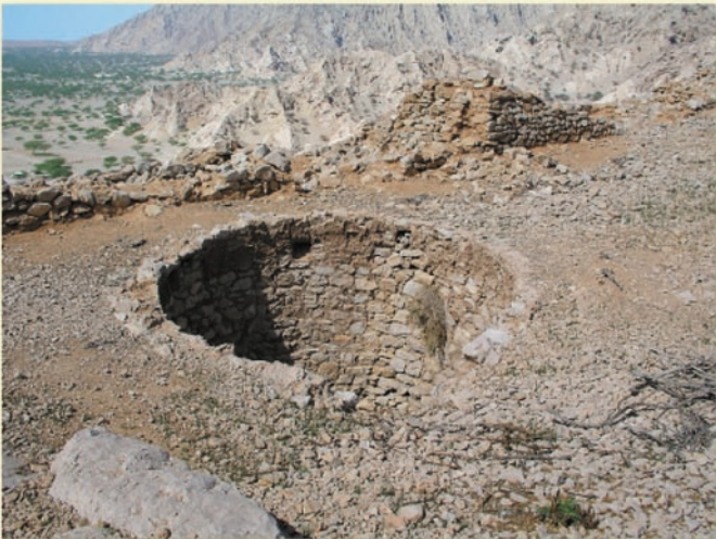
Another cistern in the upper terrace