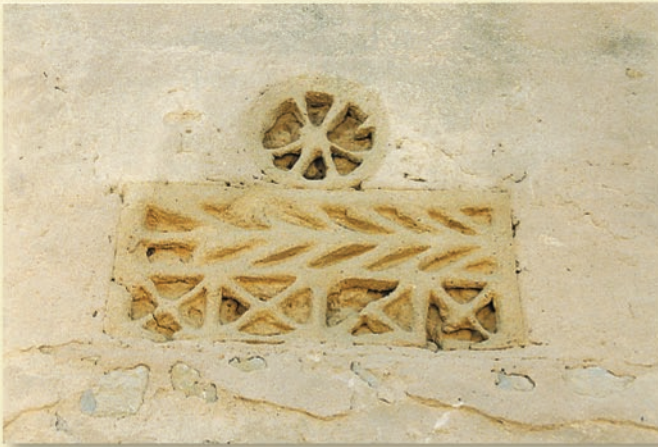
Decoration above the entrance of house 1