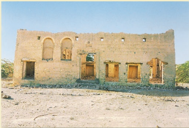
Frontside of house 1