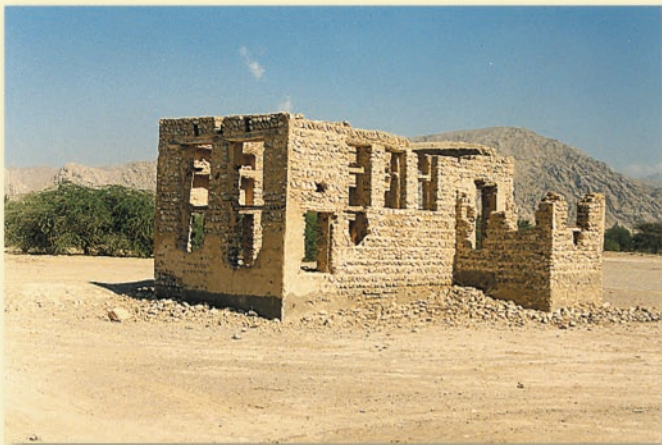
House 2 from the south-west