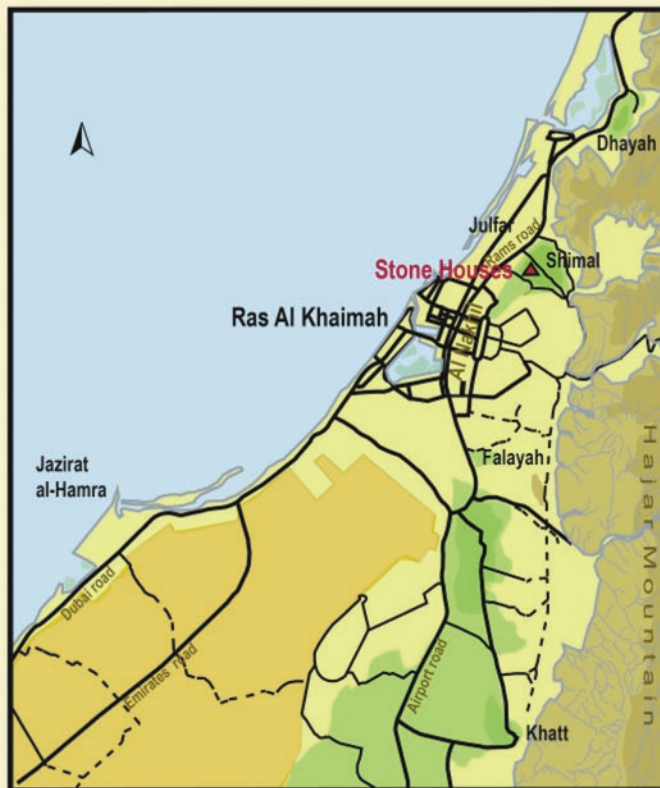
Location of the Shimal Stone Houses