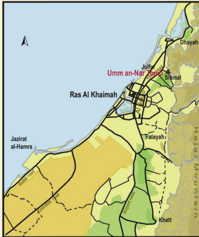
Location of the Umm an-Nar Tomb