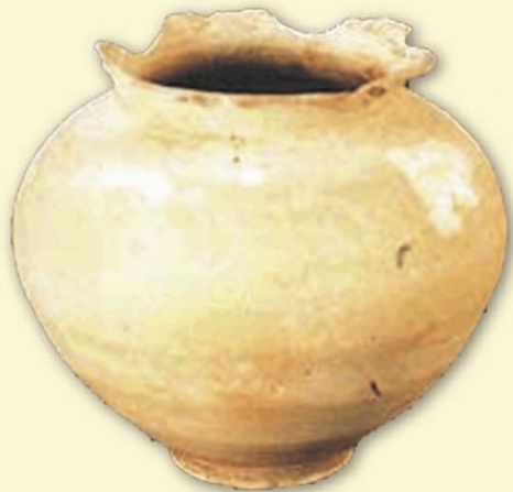
Local Umm an-Nar pottery