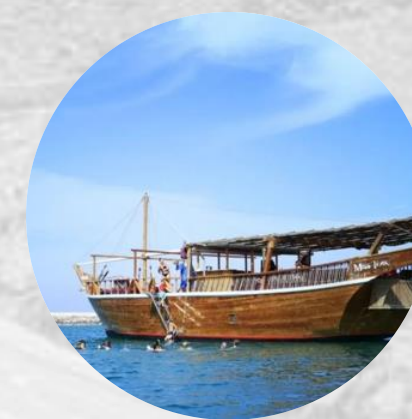
Miss Teak Dhow