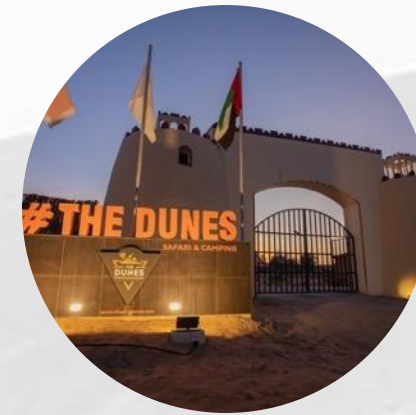
The Dunes Camping