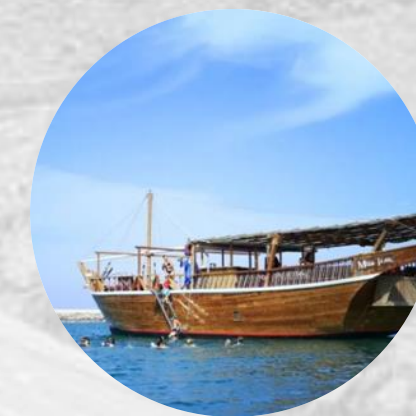
Miss Teak Dhow