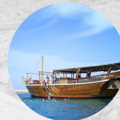
Miss Teak Dhow