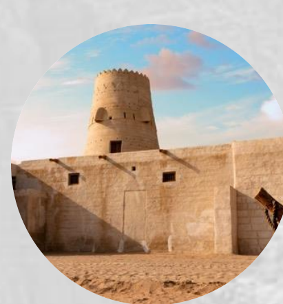
Al Jazeera Al Hamra