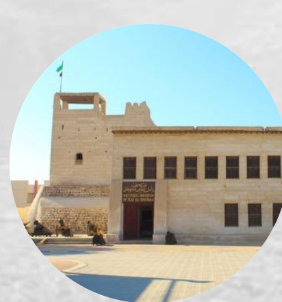
The National Museum