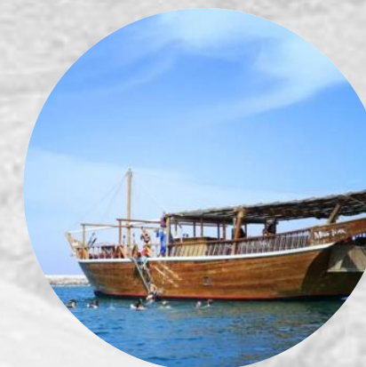
Miss Teak Dhow