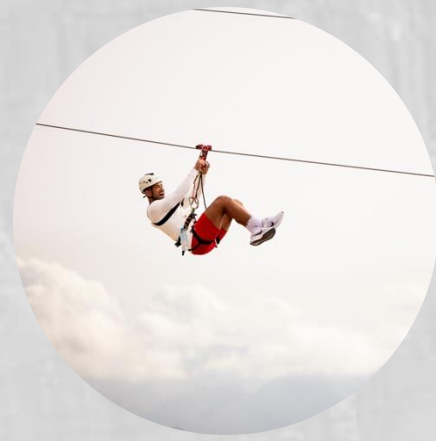
Jais Sky Tour