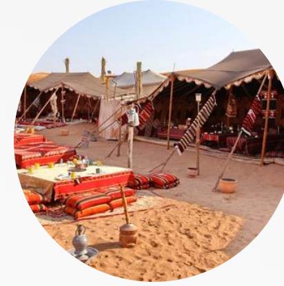
Bassata Desert Village