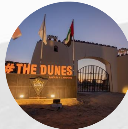
The Dunes Camping