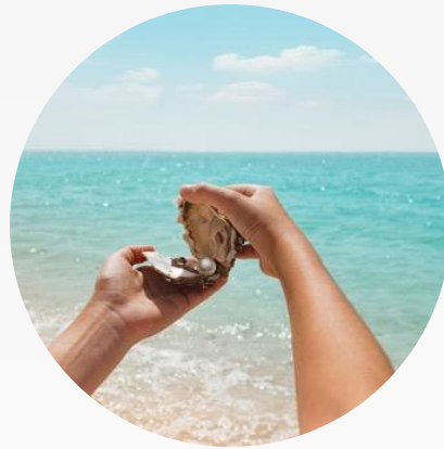
Suwaidi Pearl Farm