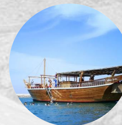
Miss Teak Dhow