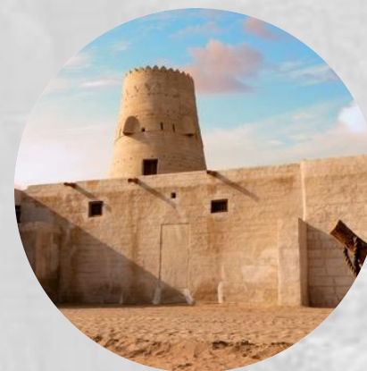
Al Jazeera Al Hamra