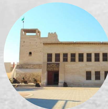
The National Museum