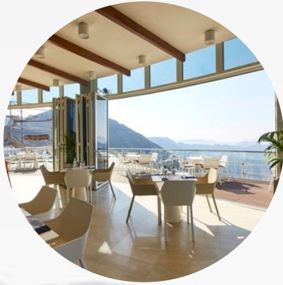
1484 by Puro