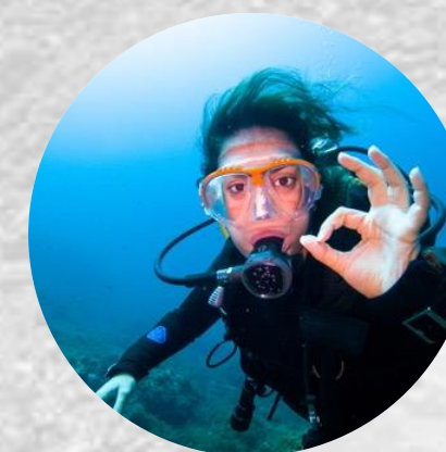
Al Jazeera Diving Centre