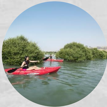
Challenging Adventure Kayaking