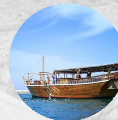
Miss Teak Dhow